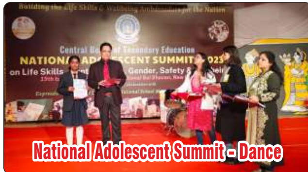
National Adolescent Summit - Dance