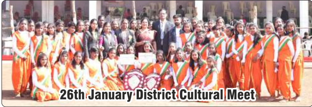
26th January District Cultural Meet