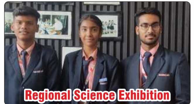
Regional Science Exhibition