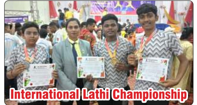
International Lathi Championship