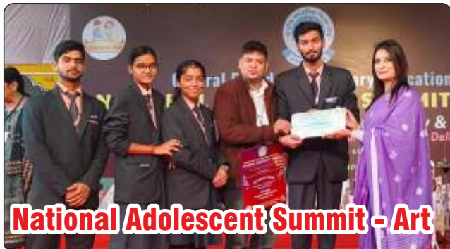
National Adolescent Summit - Art