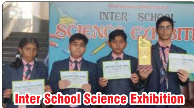
Inter School Science Exhibition