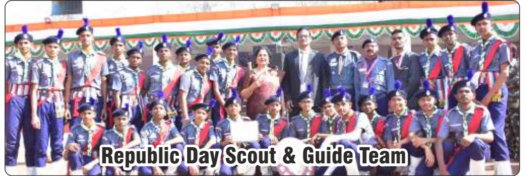
Republic Day Scout & Guide Team