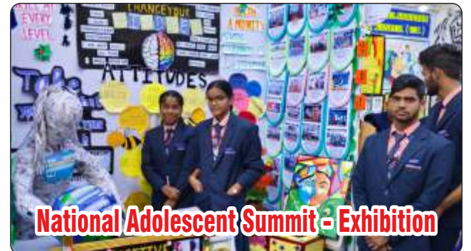
National Adolescent Summit - Exhibition